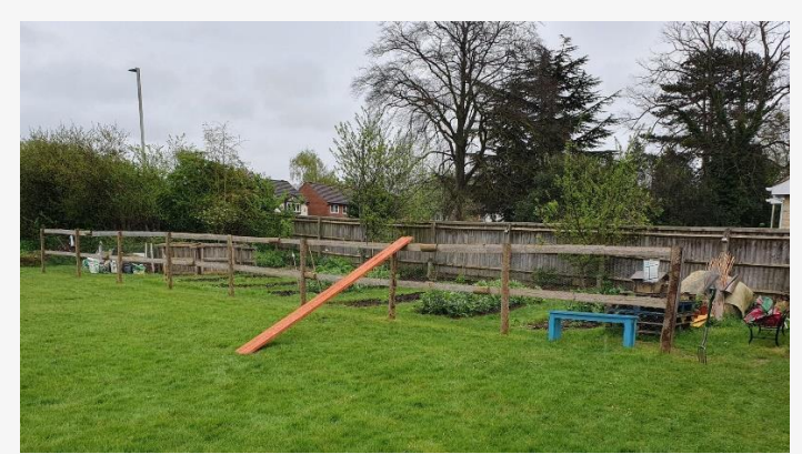
The 12ft long scaffolding boards were painted and ready to be used in the garden

A man took 12 scaffolding boards which had been donated by the city's Altitude Scaffolding. Police have been informed.