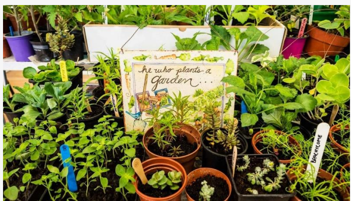
Volunteers grow mostly vegetables which are then donated

"We are going to need 12 more 12ft scaffold boards to complete our raised beds and would be grateful if anyone has any spare to donate to the project."